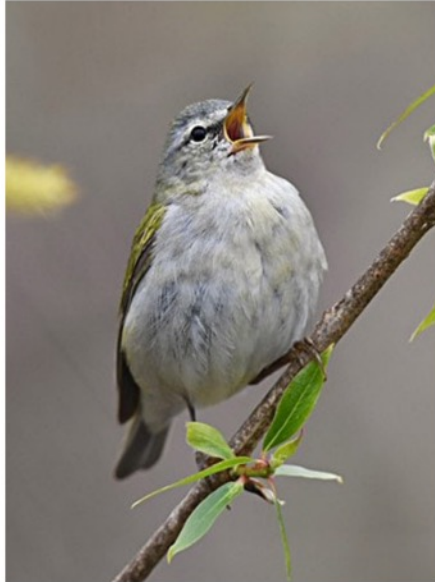
Pictured here: Tennessee Warbler.